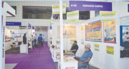
Side View Staff of Parivahan Sampda in Truck Trailer & Tyre Expo