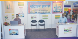
Attractive Stall of Parivahan Sampda in Truck Trailer & Tyre Expo