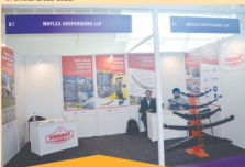
Display of Moflex Suspensions LLP, Ahmedabad at Expo, Gandhinagar