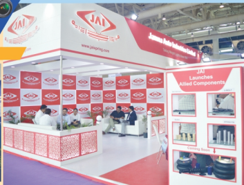
Staff of Jamna Auto Industries Limited Interacting with their Customers