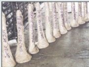
Ready for Despatch