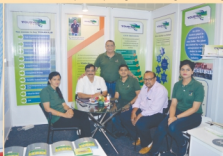
Senior Marketing team of Toughla Brake Lining with their Gujarat distributor in official dress code.