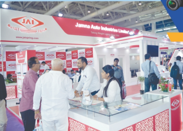
Senior Marketing Staff of Jamna Auto Industries Limited Dealing with Customers